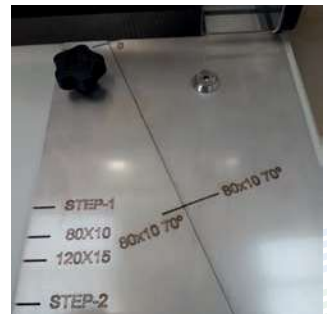
Setting for diagonal finger